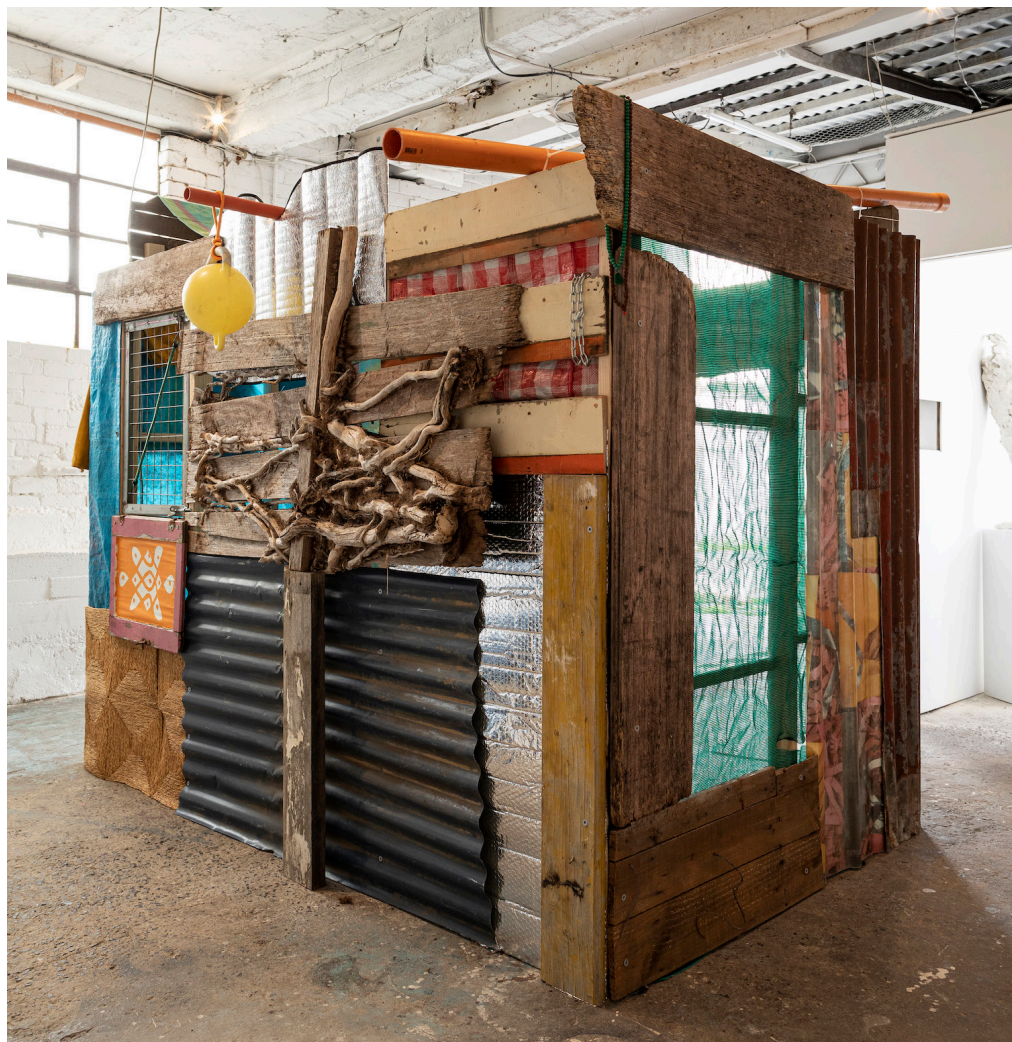
Georgia Morgan, Paradise Utility , 2019, pine, screws, bugles, cage door, cable ties, corrugated iron, found timber, air conditioning tube, rope, weed mat, staples, pipe cleaner, blue tarp, sindoor, ash, foam, texta, wire fence, basket, buoy, shade cloth, fibre glass, besser blocks, hot water urn, saree, 250 x 141 x 200cm.