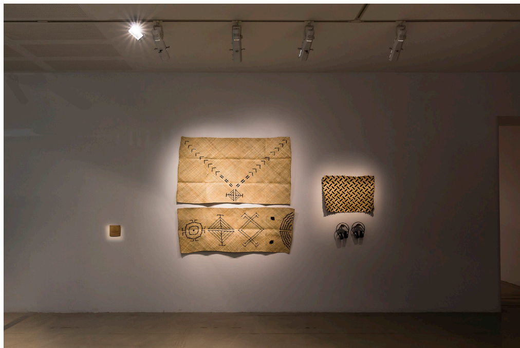
Yasbelle Kerkow, Our Inheritance , 2019, Voivoi (pandanus), Mat 1: 150cm x 90cm; Mat 2: 60cm x 150cm; Vakadivilivili (Batiki weave) 50cm x 70cm, sound 00:03:04.