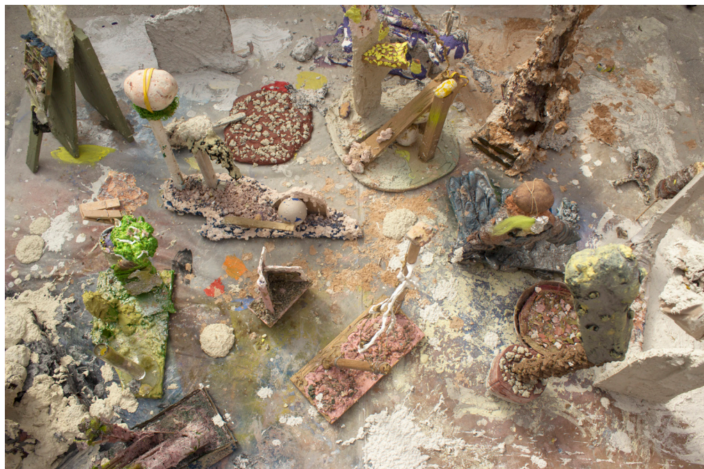
Anti-Poem , 2020, wood, cement, sand, gravel, candle, cardboard, clay, plaster, papier mache, paper, magiclay, oven-bake clay, ceramics, fake potato, sponges, liquid nails, copper sheet, styrofoam, polyurethane foam, foam rods, wire, rubber bands, gloves, rope, house paint, spray paint, curly hair, wool, chalk, pigmented cement rocks, chicken wire, aluminium foil, metal rods, fabric, spoons and drop sheet, 103 x 150 x 200cm.