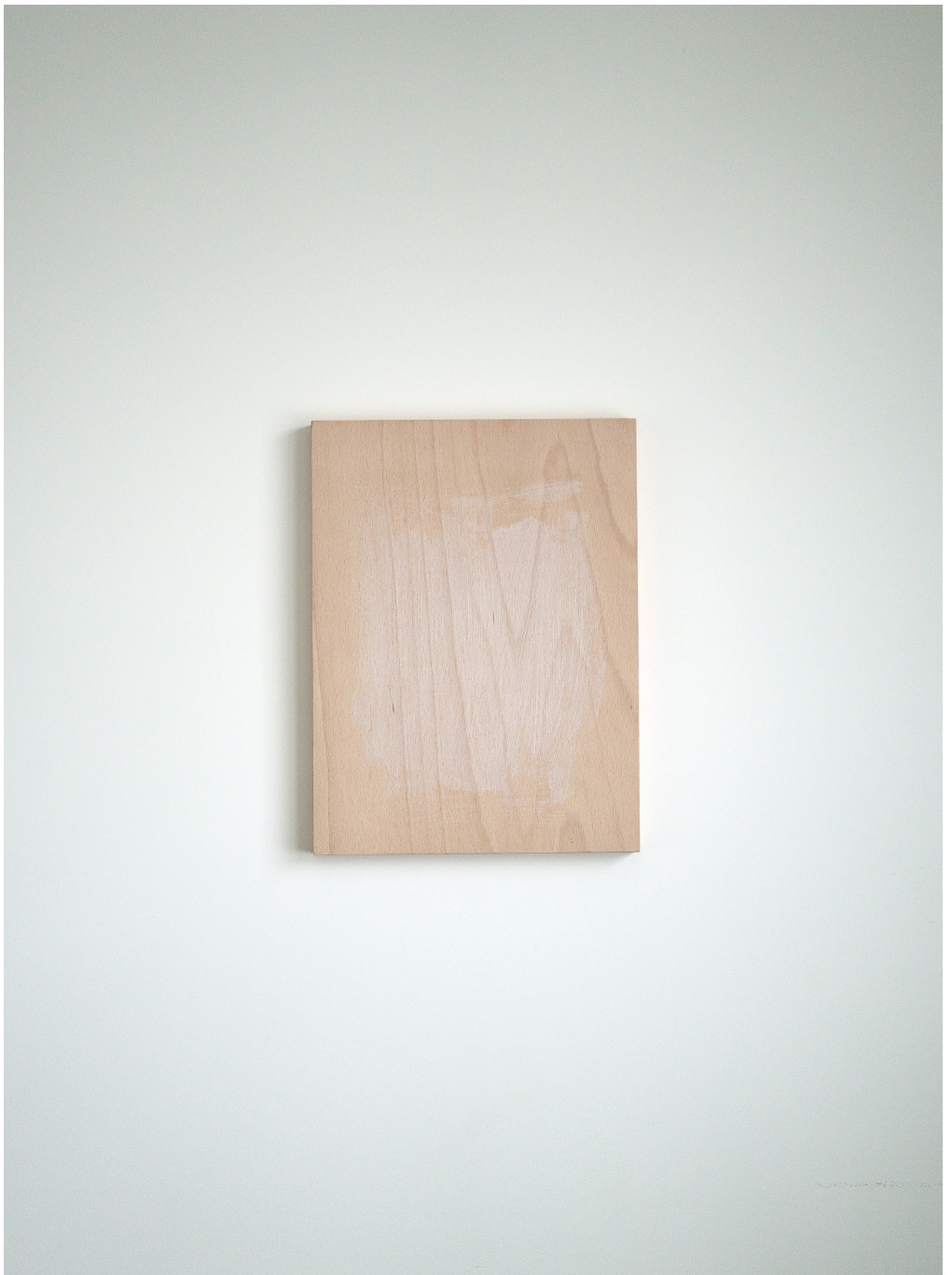
James Nguyen, Monochromes , 2018–ongoing, birch panels and mixed media skin lightening products, 10 panels, 40 x 30 x 3cm each.