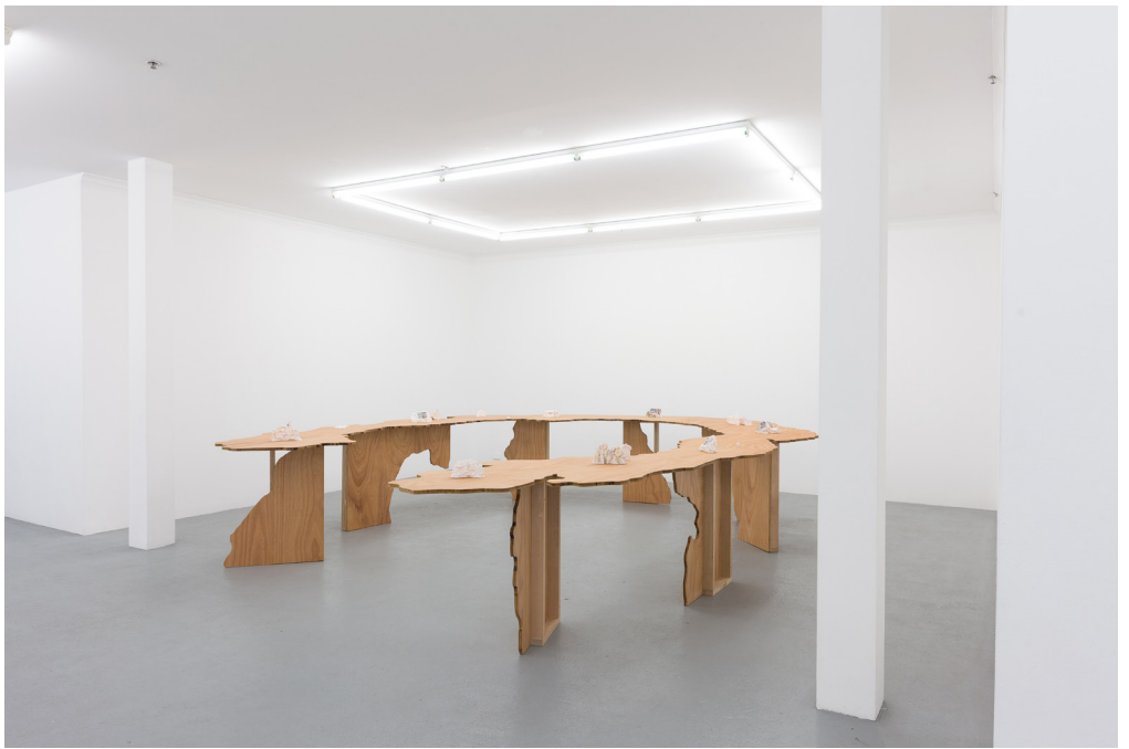
Jess Bradford, An Image of a Tiger , 2018, plywood, Tasmanian oak, metal, ceramics, pastel and liquid pencil on primed aluminium, dimensions variable.