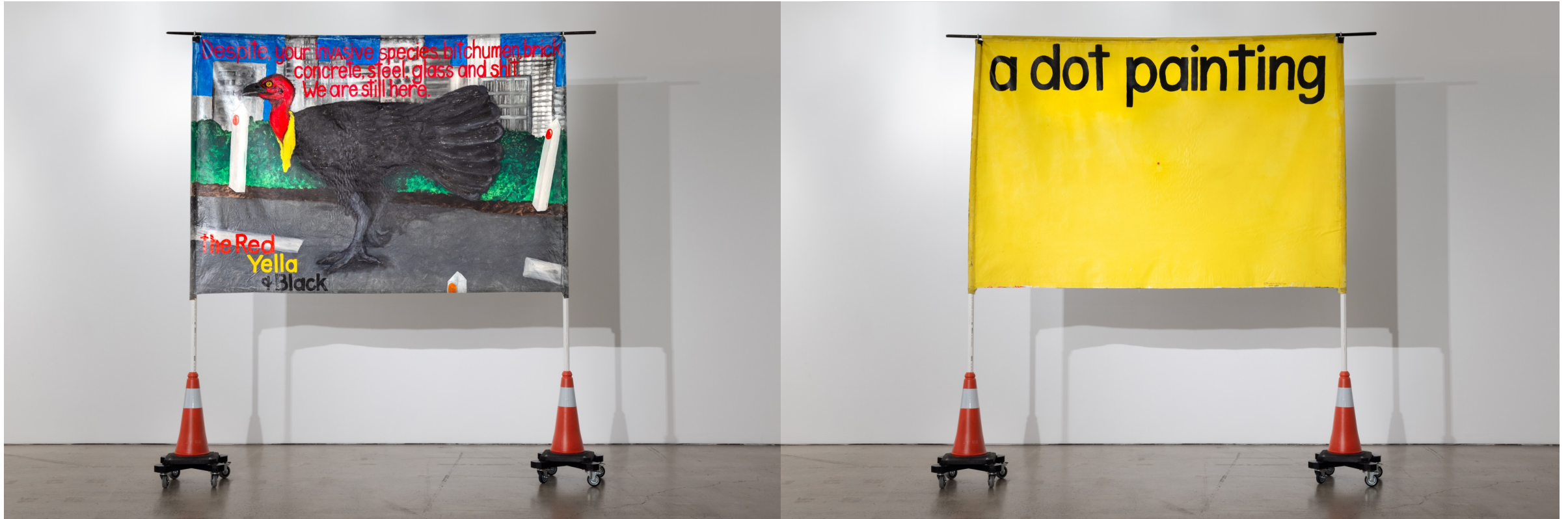
Image: Gordon Hookey, TheRedYella&Black / ADotPainting No. 184 , 2022. Installation view, 'A MURRIALITY', UNSW Galleries, Sydney, 2022. Photograph by Jacqui Manning. © Gordon Allan Hookey / Copyright Agency, 2022.